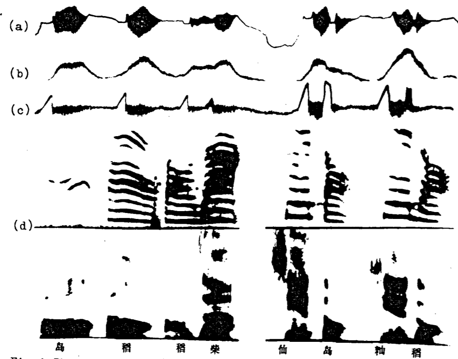
Fig.1 The records of (a) air flow through glottis, (b) subglottal pressure, (c) supraglottal pressure with (d) the related spectrograms.

the same as it is in Chang Yinsha dialect. On the bases of the above investigations, we posit two hypotheses. First, if we view the situation from isolated words, the phonetic value of the I.V.C. in Wu has become completely voiceless, its abstract distinctive function in a word has been taken over by the 'Yang' tone pattern of the syllable. Secondly, if we view them from running speech, the value of the I.V.C. alternate between voice and voicelessness. In this case, distinctive role of the I.V.C. in a word is played by the phonetic value of the I.V.C. or by the 'Yang' tone pattern of the syllable, and this regular alternation seems to be dependent on the stress type of relevant syllable in speech.